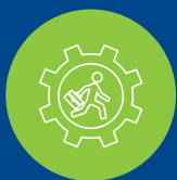
Support & Field Services